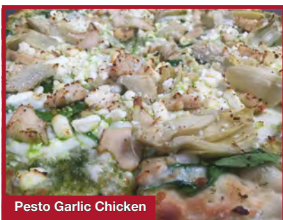
Pesto Garlic Chicken