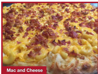
Mac and Cheese